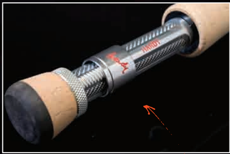
The stylish and incredibly light anodised alloy reel seat has a single ring unlatching system with a Teralium insert.