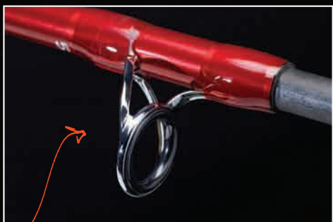
Incredible care has been taken to ensure the whippings match up to the blank. They are so translucent the legs of the guides are just visible.